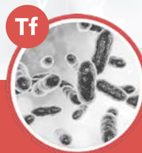
Tf Tannerella forsythia