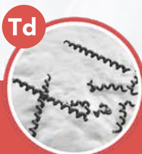
Td Treponema denticola