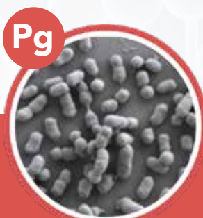
Pg Porphyromona gingivalis