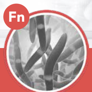
Fn Fusobacterium nucleatum

THESE PATHOGENS CAN BE CLEARED IF YOU ARE TESTED