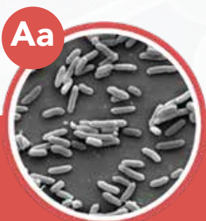
Aa Aggregatibacter actinomycetemcomitans

Evidence shows that 5 HIGH RISK Oral Pathogens are causative drivers of inflammation and disease.